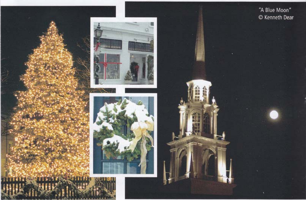
"A Blue Moon" © Kenneth Dear